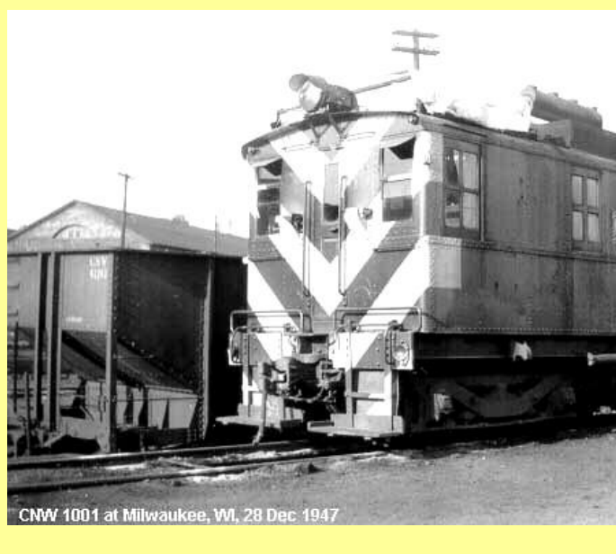
This is the engine Harold refers to, less the snow. I Photo courtesy of Don Ros